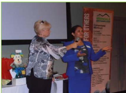
Ambassadors pull business cards to award door prizes at a monthly